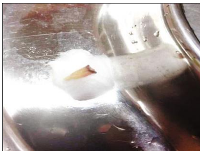
Fig 3: Clinical photograph showing a completely removed tooth under local anaesthesia

Differential Diagnosis and Its Consideration. Verrucous carcinoma has particular clinical and histopathological features that agree its diagnosis to be obtained, which was