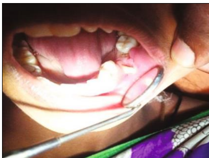
Fig 1: Clinical photograph showing a solitary, firm, ulcerative tissue measuring 2x2 centimetres on the alveolar mucosa near the premolar region.

Histopathological analysis showed a broad bulbous rete pegs with pushing margins in many areas along with features of mild dysplasia and few areas of parakeratin plugging. There were also few areas of severe dysplasia without significant break in the basement membrane and malignant cells infiltrating into the subjacent minimal connective tissue stroma with inflammatory cells which led to a provisional diagnosis of verrucous carcinoma of buccal mucosa.