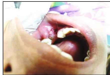
Fig 4: Clinical photograph showing nodular proliferous ulcerative growth measuring 3x2 centimetres on the alveolar mucosa.

an uncharacteristic observation in the present case. First, the clinical reasons for rejection were considered followed by the histological ones for each diagnosis, to obtain a final diagnosis thus clearly separating from others. Oral traumatic fibroma was ruled out since it presents as a firm smooth papule in the mouth, usually the same color as the rest of the mouth lining, but is sometimes paler or, if it has bled, may look a dark color. The surface may be ulcerated due to trauma or become rough and scaly. It is usually dome-shaped but may be on a short stalk like a polyp or pedunculated [6]. It should be noted no histological dysplastic features and other observations are not present and fibromas never develop into oral cancer, similarly verrucous hyperplasia (VH) are often associated with papillomas or arise as a de novo lesion. VH (verrucous hyperplasia) and PVL (Proliferative Verrucous Leukoplakia) are irreversible clinicopathologic lesions with considerable potential for evolving into verrucous or squamous cell carcinoma. PVL is a disease of the oral cavity in which VH is a part of its developmental spectrum. Human papillomavirus, as a cofactor, may play an important role in some of these lesions [7, 8]; however, no signs suggestive of HPV infection were observed in the present histopathology section.