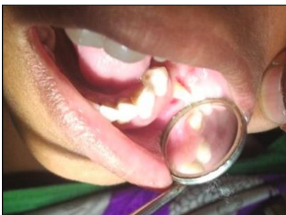
Fig 2: Clinical photograph showing the stretching of the cheek mucosa a tooth root found extruding from the socket impinging on the soft tissue counterpart surrounding areas.