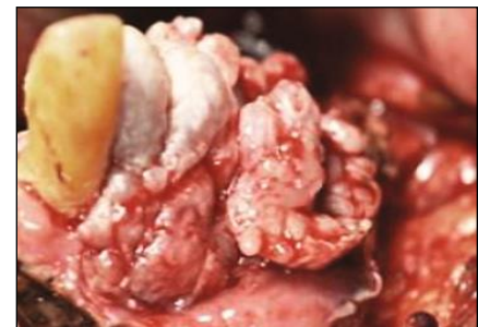
Fig 5: Clinical image showing a wide local surgical excision performed under local anaesthesia.